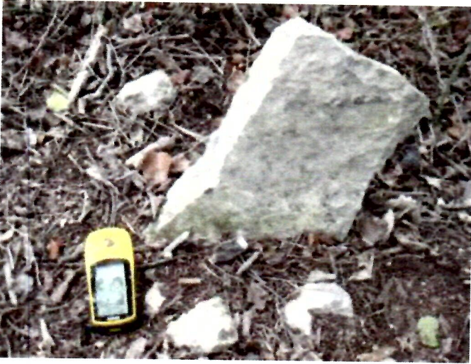
4) Unnamed N30 47 103 W097 41 525 (+/- 19')