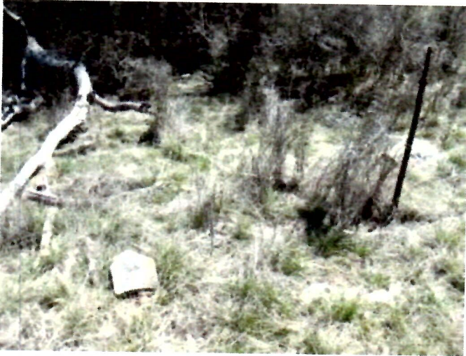
10) Stone near to Hill stone