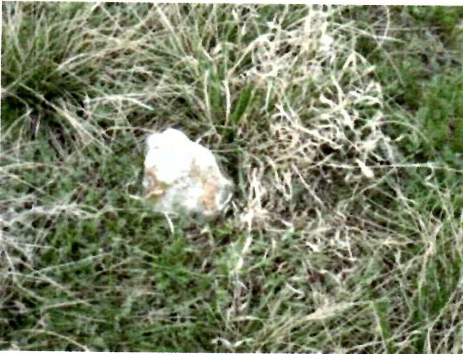
7) Granite stone Protrusion N30 47 101 W097 41 505 (+/- 15')