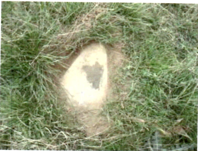
11) Rough stone partially buried May have light inscription or carvings N30 47 102 W097 508 17 (+/- 17')