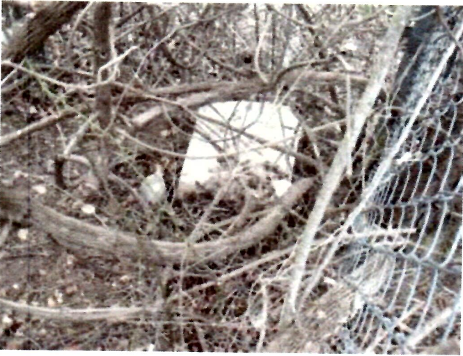
8) Unnamed in small fence