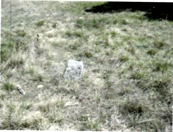
6) Stone N30 47 102 W097 41 510 (+/- 15')