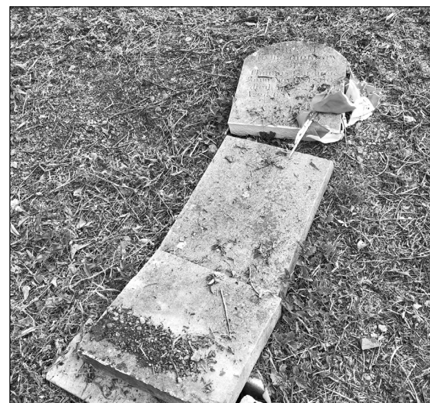
TOP: Volunteers under the direction of Williamson County Historical Commission Cemetery Committee try to salvage remains of broken headstones at the Gardner Cemetery. BOTTOM LEFT & RIGHT: At least five headstones, dating back to the Civil War era, were destroyed after someone vandalized a cemetery in Circleville.